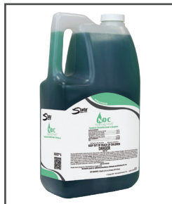
NDC™ Neutral Disinfectant Cleaner