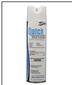
Quick Defense™ Ready-to-Use Disinfectant