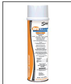
Discover™ Aerosol Disinfectant and Deodorizer