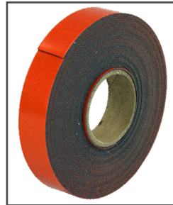
Make-A-Bond™ Double-Sided Adhesive