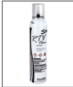
RTV™ Silicone Adhesive/Sealant/ Caulk/Gasket Marker