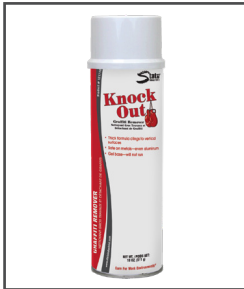
Knock Out™ Aerosol Graffiti and Soil Remover