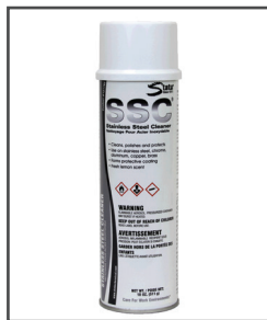
SSC Stainless Steel Cleaner