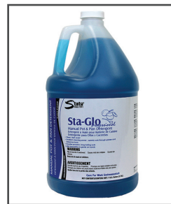
Sta-Glo Pot & Pan Manual Detergent