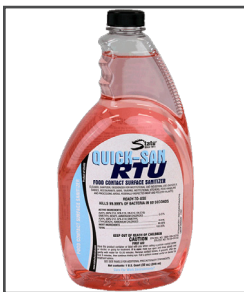
QUICK-SAN RTU Food Contact Surface Sanitizer