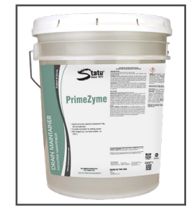
PrimeZyme™ Liquid Bacterial/ Enzyme Treatment