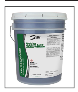
Ecolution® Drain Line Maintainer Bacterial Lift Station Maintainer