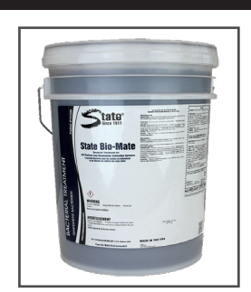
Bio-Mate ™ Biological Catalyst