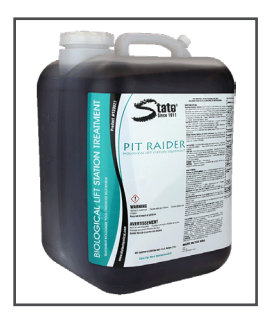
Pit Raider™ Hydrogen Sulfide and Sludge Treatment